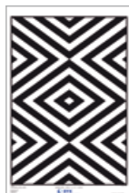
Cat. No. 2823