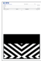
Cat. No. 2821