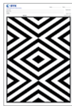
Cat. No. 2834