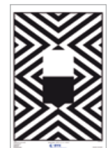
Cat. No. 2822