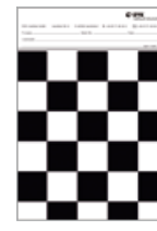
Cat. No. 2804