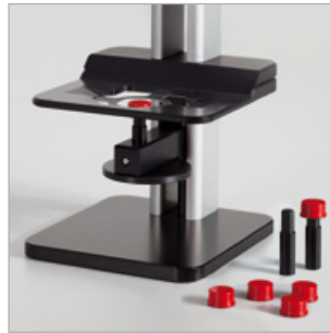
Sample pin for measuring e.g. distance sensor covers