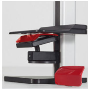
Flexible sample table for measuring e.g. headlamp cleaning device covers